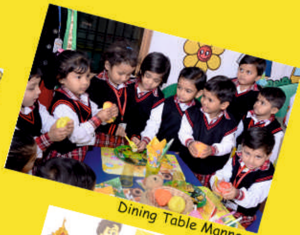
Dining Table Manners