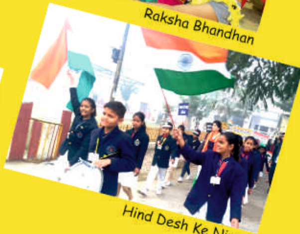
Hind Desh Ke Niwasi