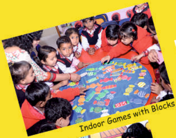
Indoor Games with Blocks