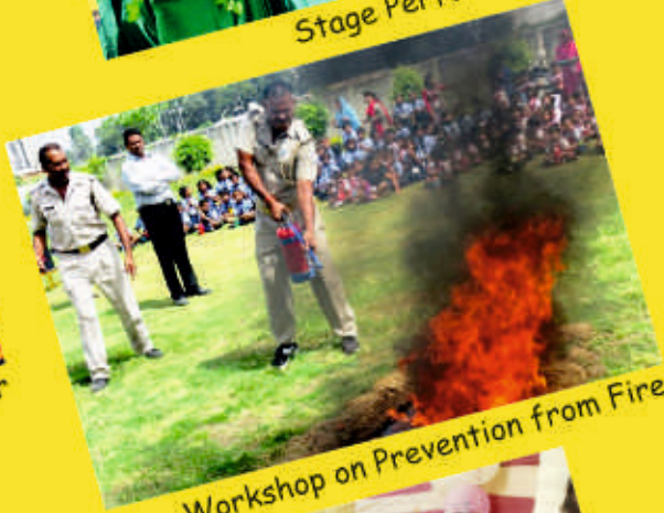
Workshop on Prevention from Fire