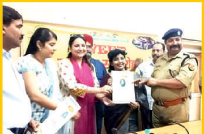
Rising Child got Award From D.M. Raebareli & S.P. Raebareli