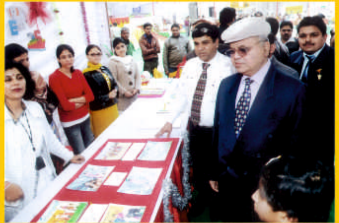
Observation of Rising Child Exhibition by District Judge Rbl.