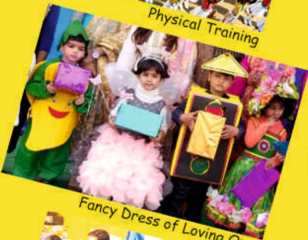
Fancy Dress of Loving Ones