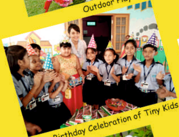
Birthday Celebration of Tiny Kids