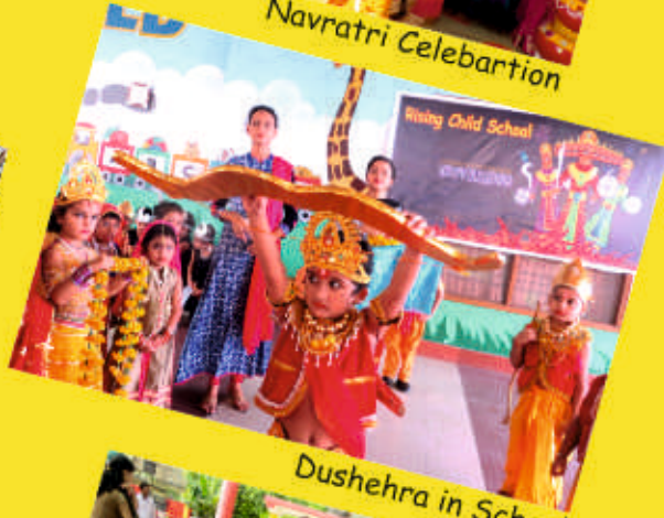
Dushehra in School