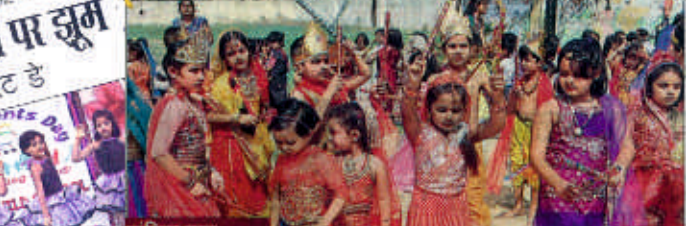
राइजिंग चाइल्ड स्कूल में मनाया गया बौद्ध पैरेट डे।

राइजिंग चाइल्ड स्कूल में मनाया गया बौद्ध पैरेट डे... बच्चों ने बौद्ध धर्म के बारे में जानकारी बढ़ाई।