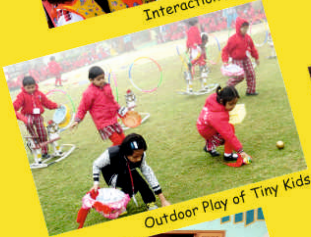
Outdoor Play of Tiny Kids