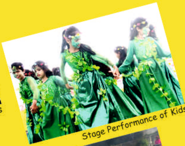
Stage Performance of Kids