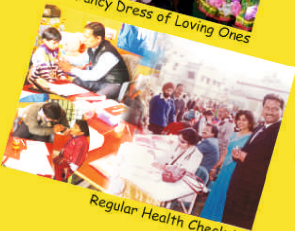
Regular Health Check-Up