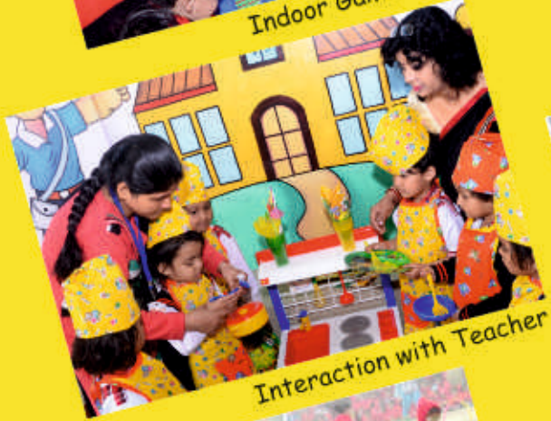
Interaction with Teacher